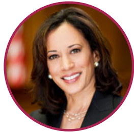
U.S. Senator Kamala D. Harris