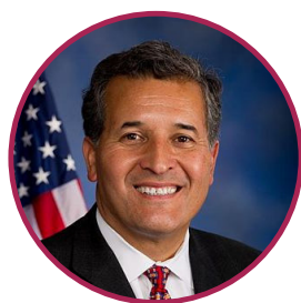
Congressman Juan Vargas D-51